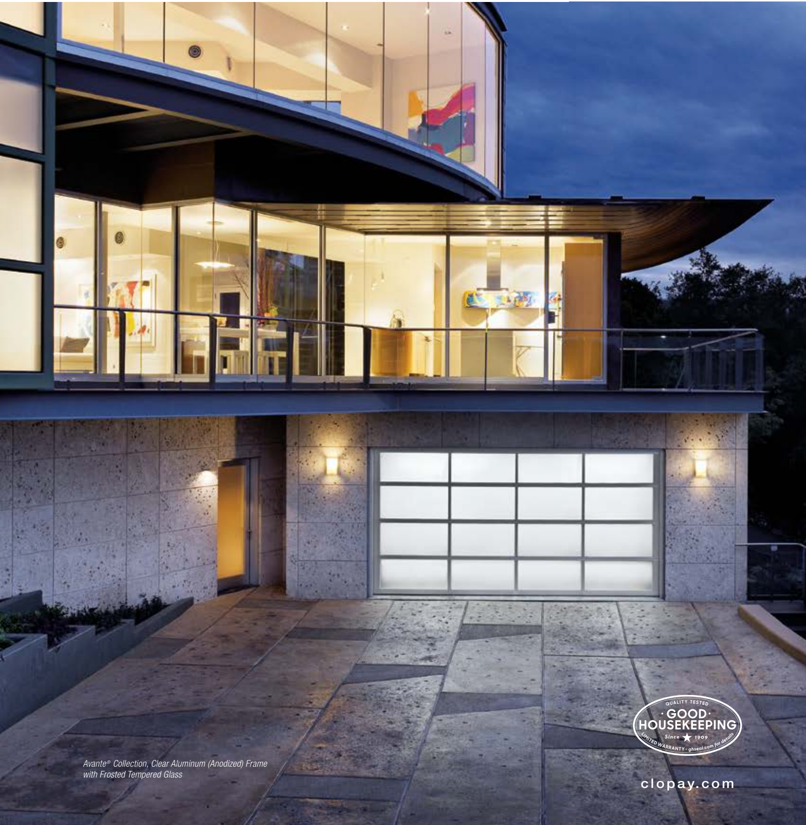
Avante® Collection, Clear Aluminum (Anodized) Frame with Frosted Tempered Glass